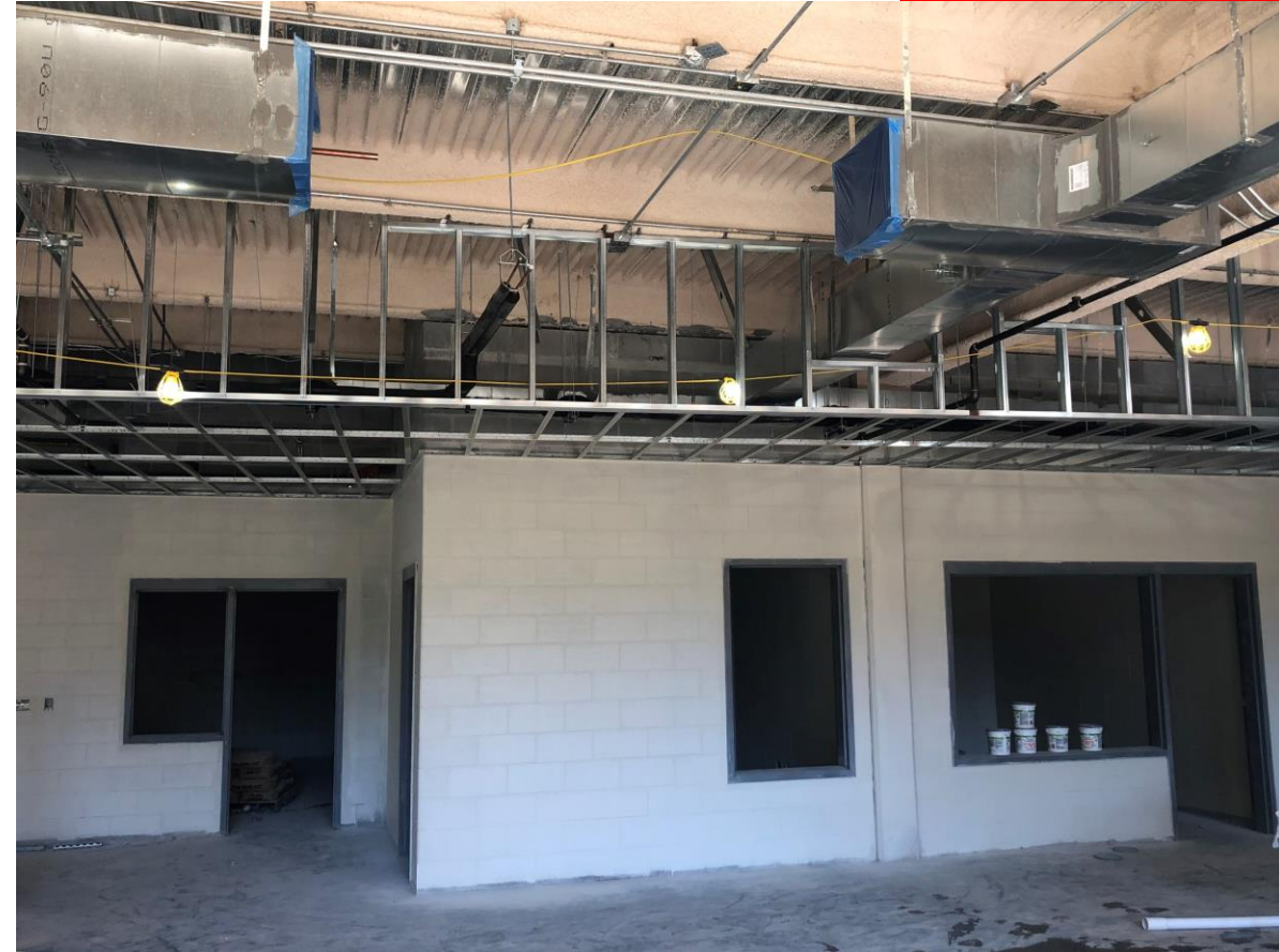
Interior Metal Framing at Media Center at New Addition