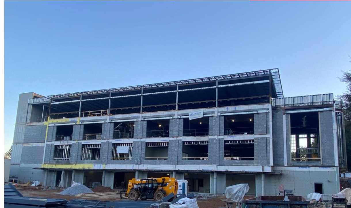
New Addition Progress