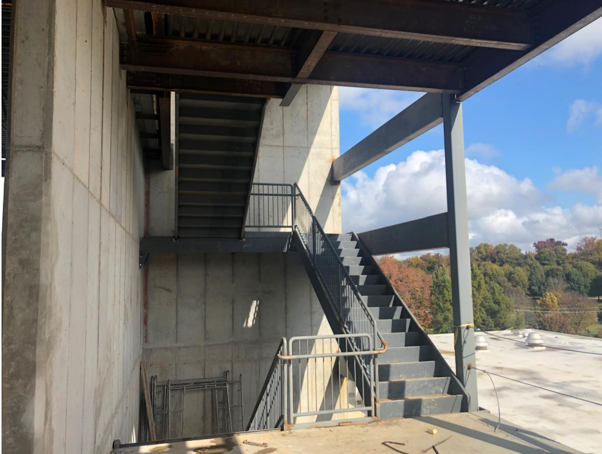
Stairwell 1 Completed at New Addition