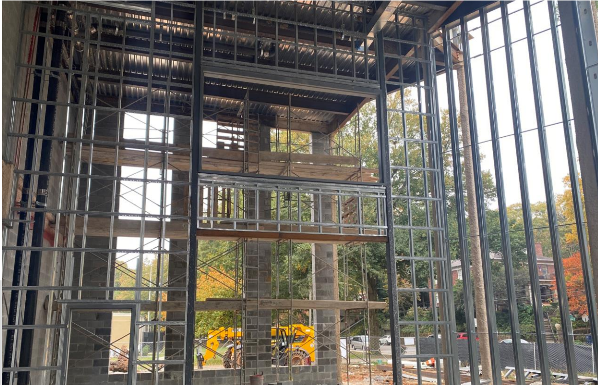
Interior Metal Framing at Media Center at New Addition