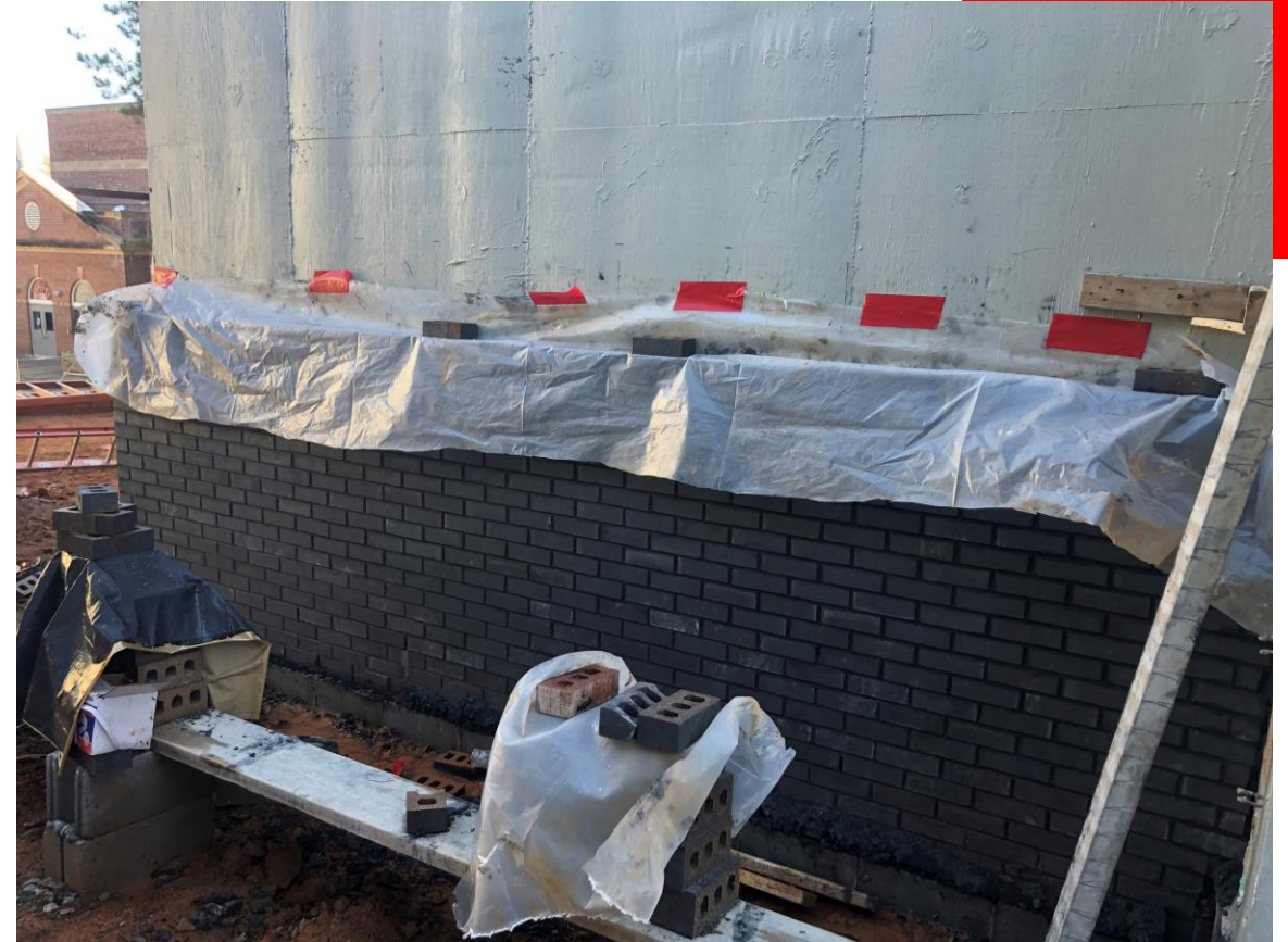
Black Brick Progress at North East Corner