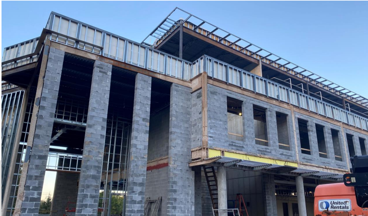
New Addition Progress