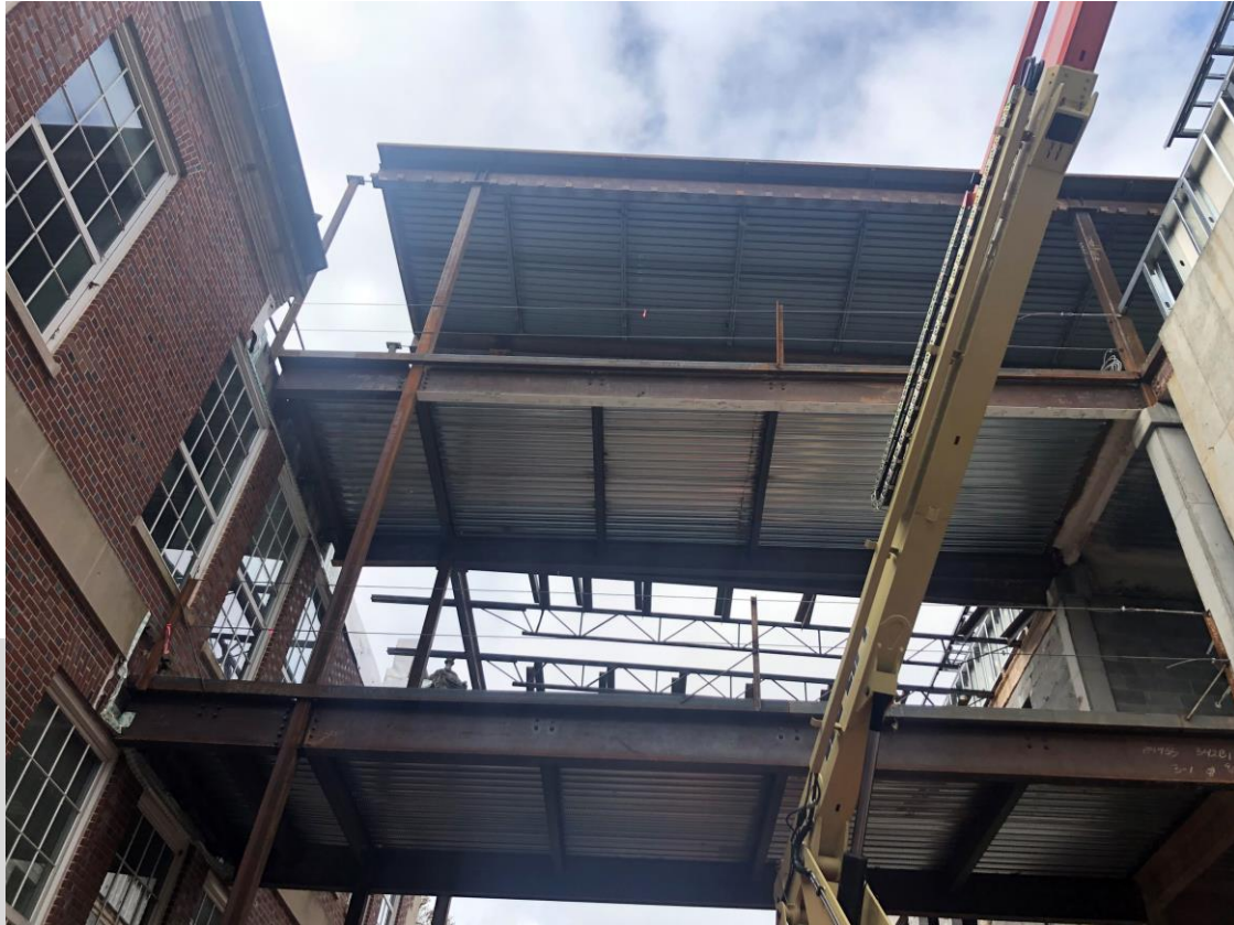
Bridge Decking at New Addition Bridge