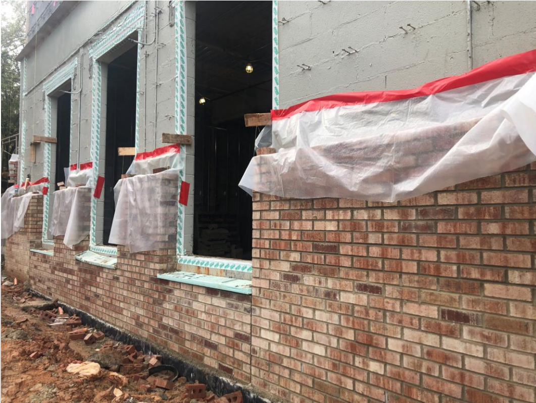
Red Brick Progress at South East Corner