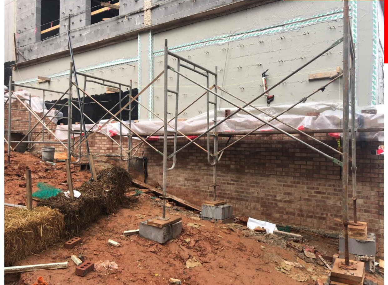
Brick Progress at South Side of New Addition